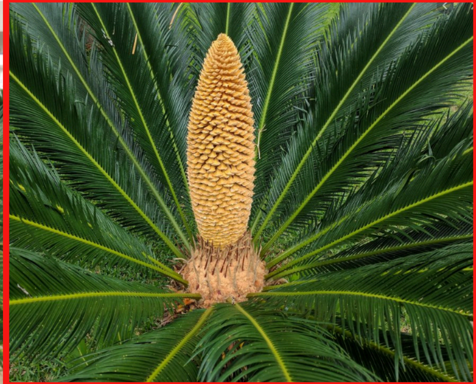
Sago palm ( Cycas revoluta )