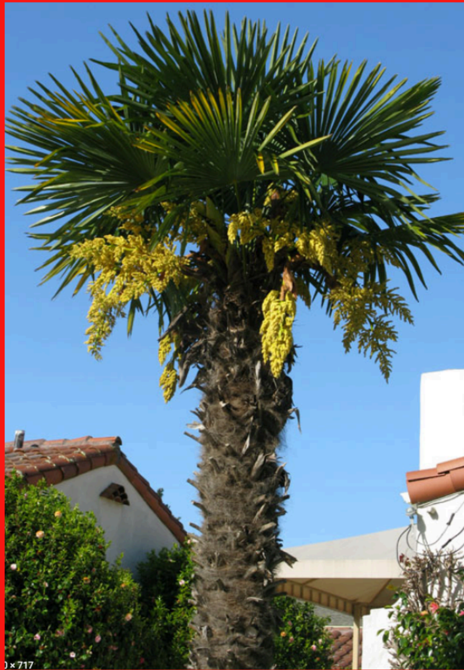
Windmill palm ( Trachycarpus fortunei )