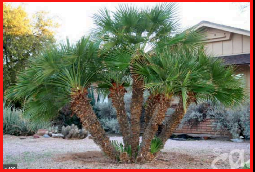
Mediterranean fan palm ( Chamaerops humilis )