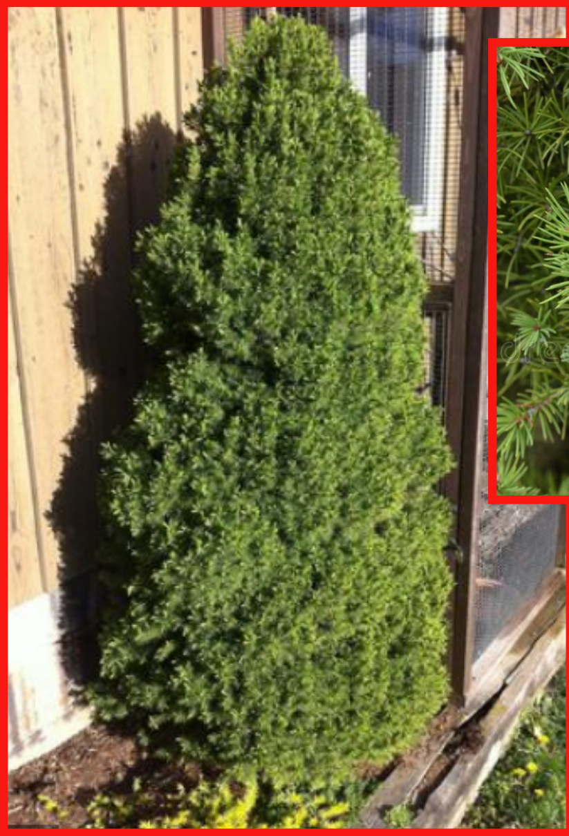
Dwarf Alberta spruce ( Picea glauca albertiana 'Conica')