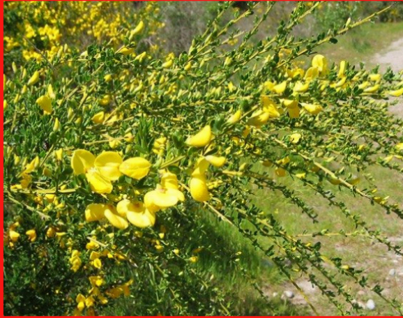
Scotch broom (Cytisus scoparius)