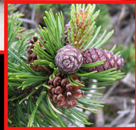
Mugo pine ( Pinus mugo )