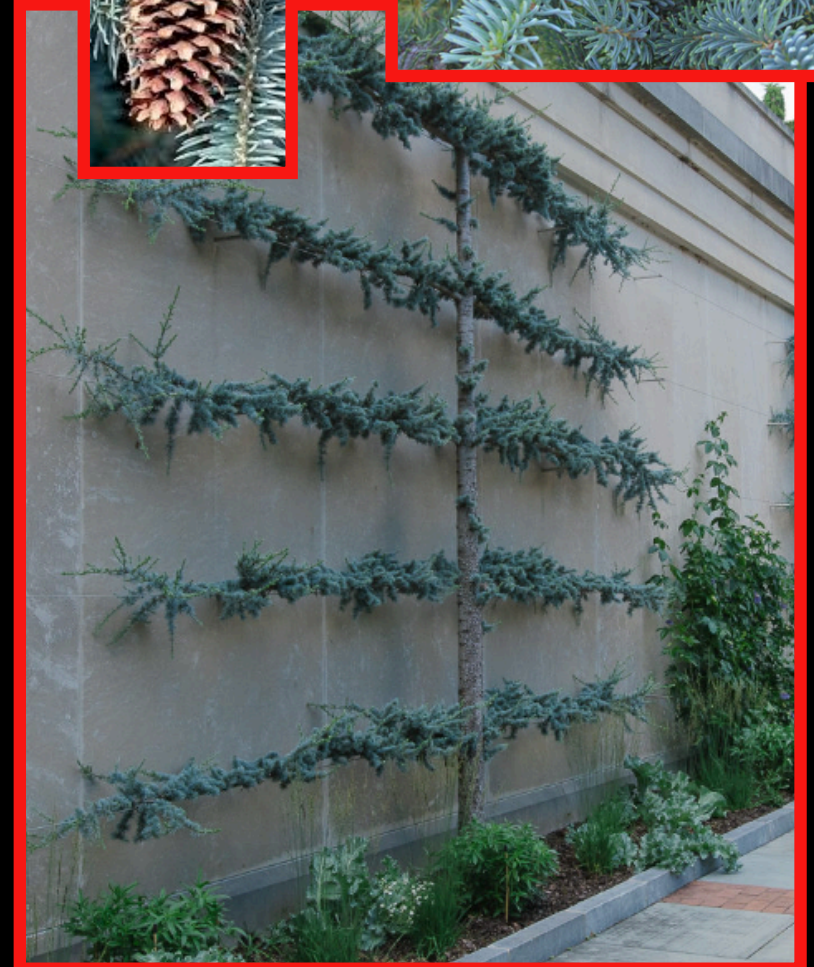
Colorado spruce ( Picea pungens )