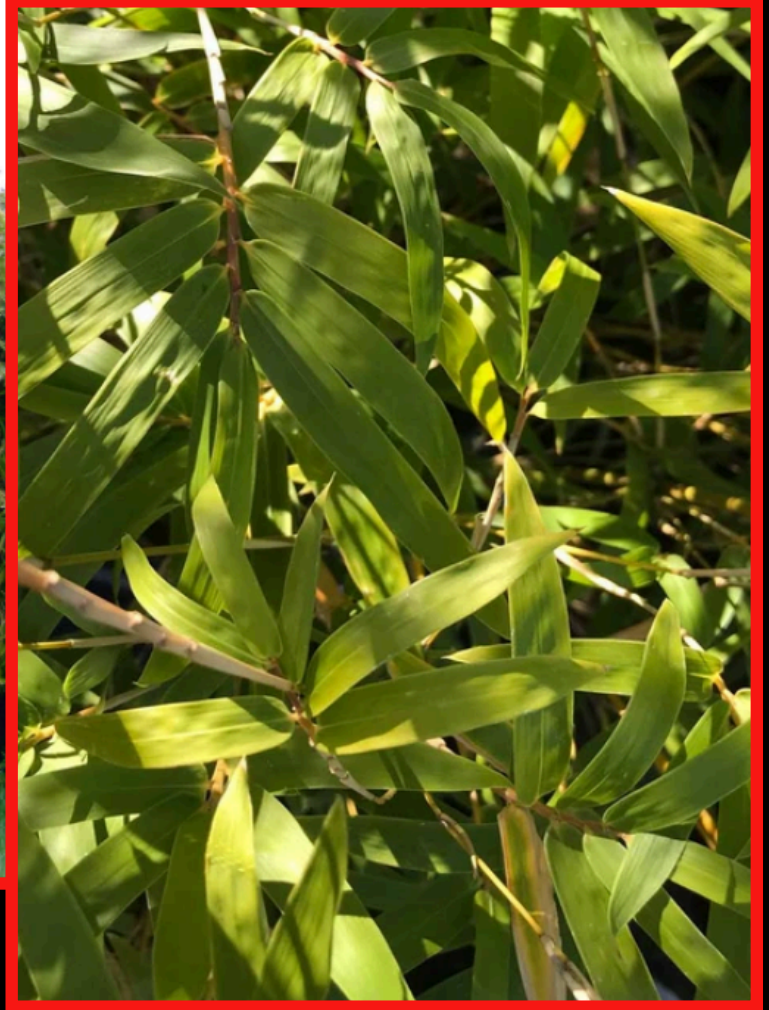
Golden Goddess bamboo ( Bambusa multiplex 'Golden Goddess')