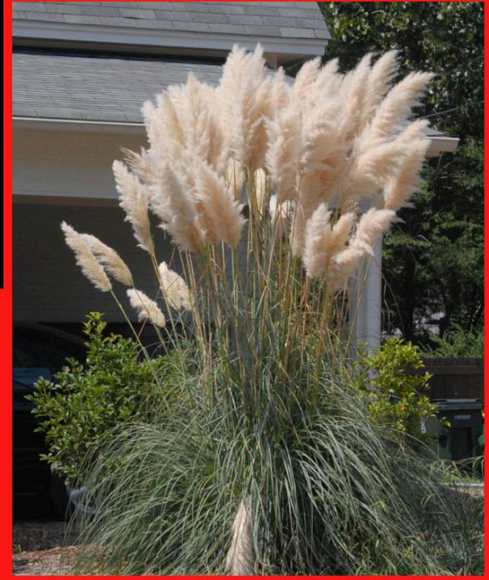
Pampas grass ( Cortaderia selloana )