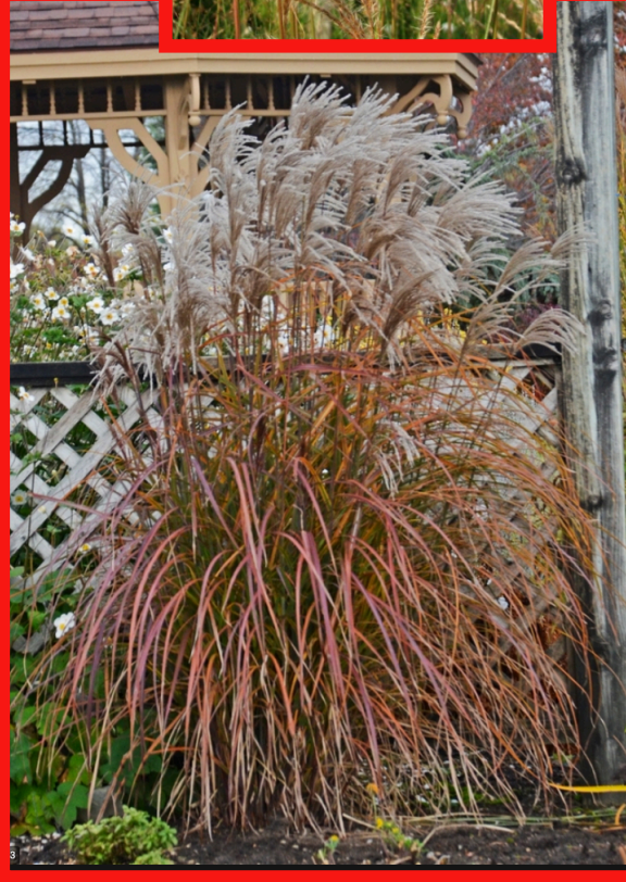
Maiden grass ( Miscantus sinensis )