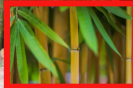
Timber bamboo ( Phyllostachys bambusoides )