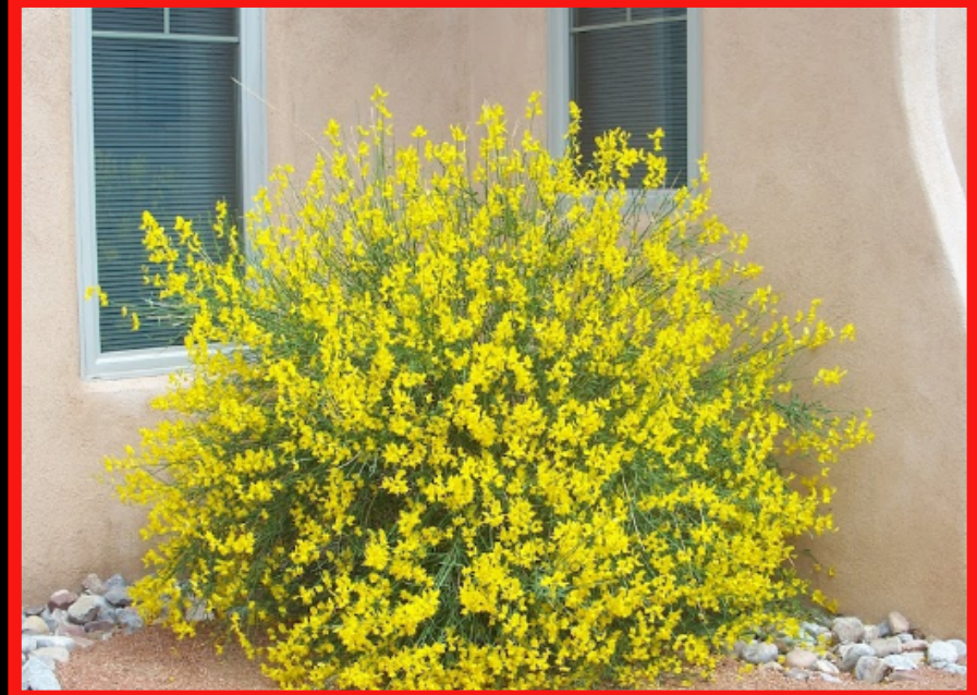
Spanish broom (Spartium junceum)