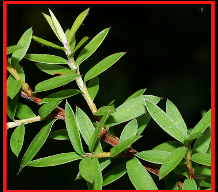
Leptospermum scoparium 'Ruby Glow'