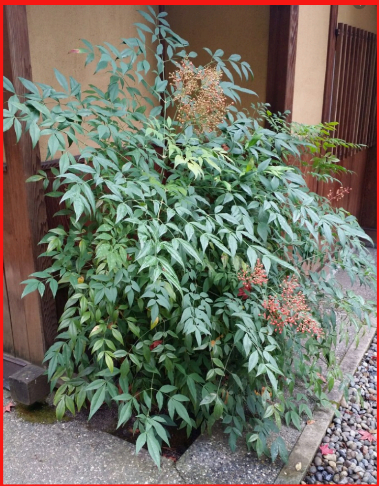
Heavenly bamboo (Nandina domestica)

Caution: the following plant is not a bamboo! Heavenly bamboo may remain in the 0-5 foot zone