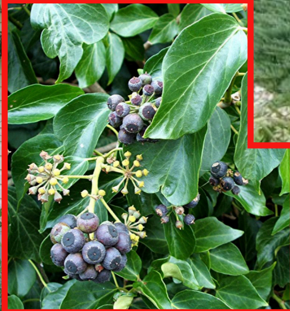
Algerian ivy ( Hedera algeriensis )