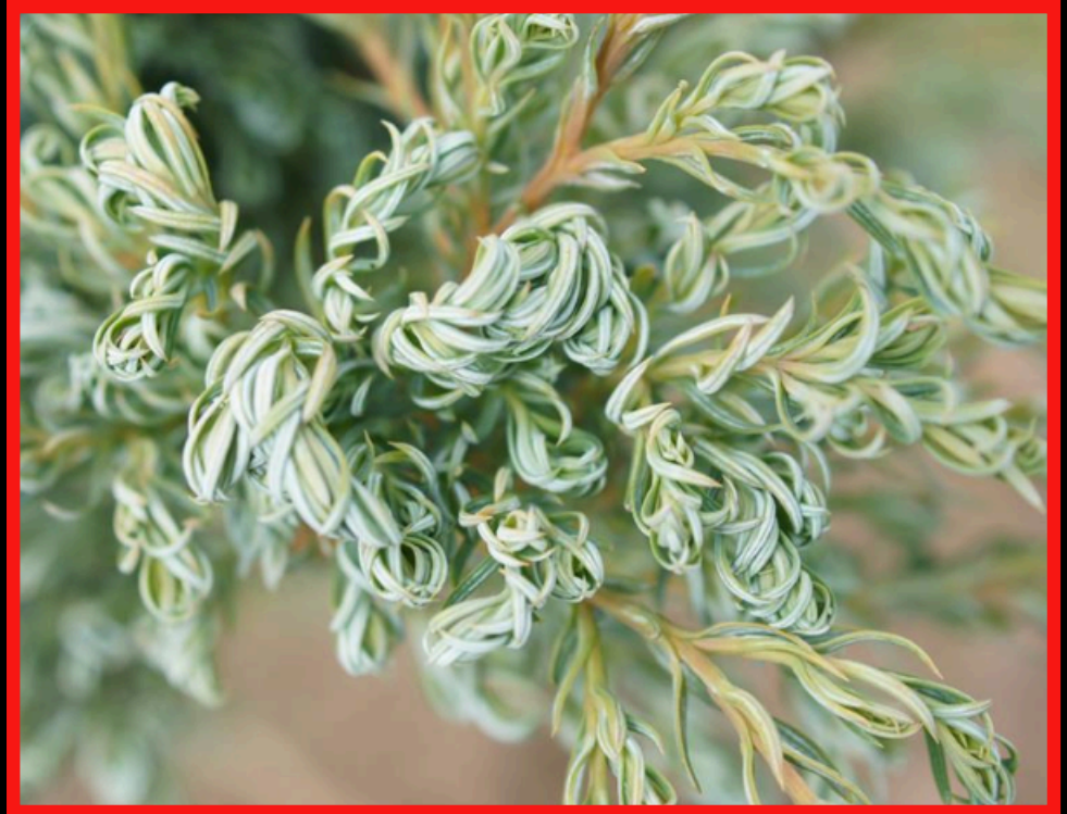
Boulevard cypress ( Chamaecyparis pisifera 'Cyano-Viridis')