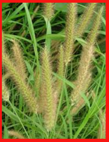
Fountain grass ( Pennisetum setaceum )