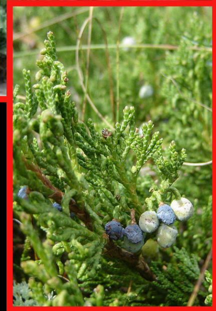
( Juniperus horizontalis )