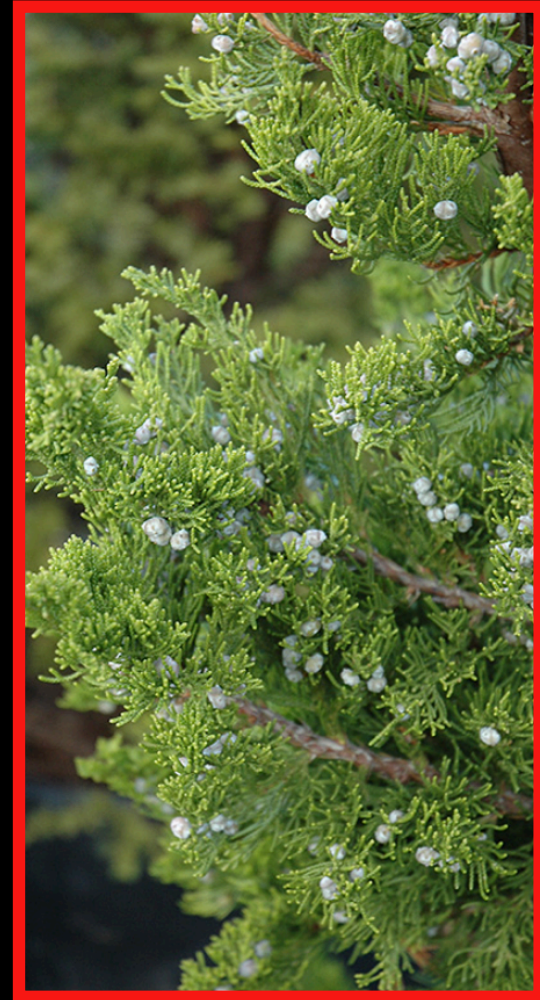
Hollywood juniper (Juniperus torulosa)