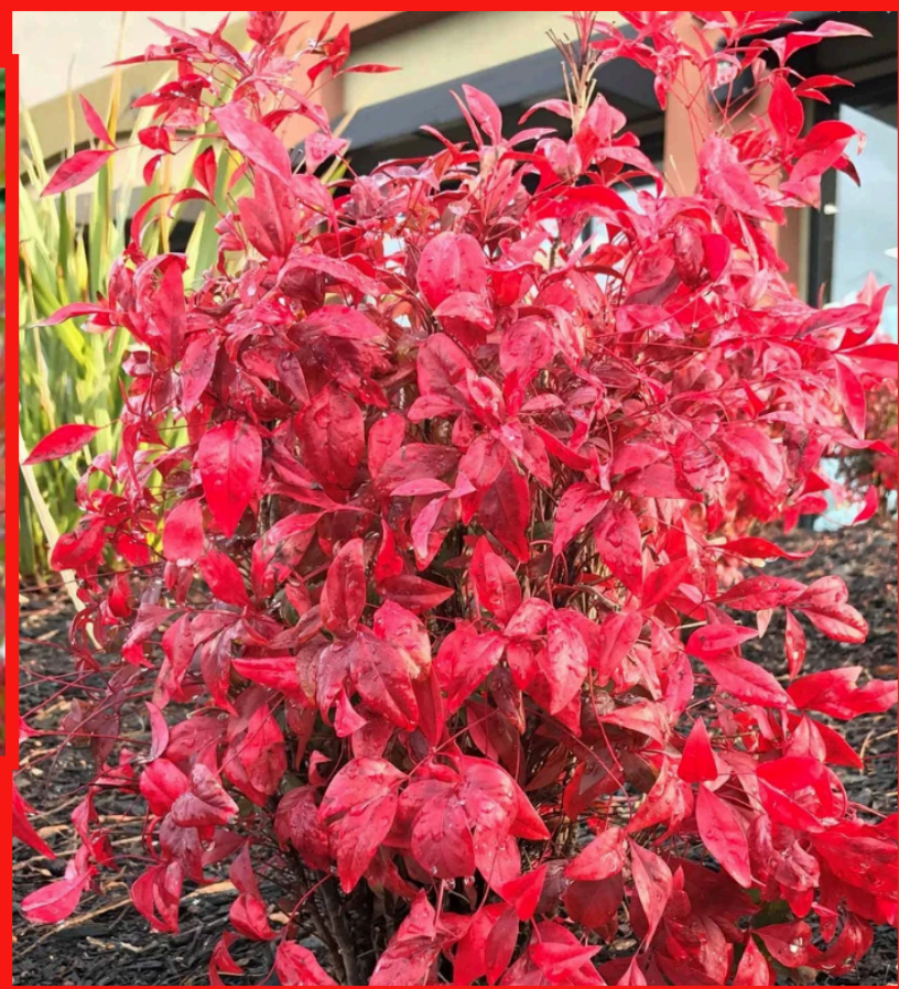
Heavenly bamboo Nandina domestica 'Fire Power'