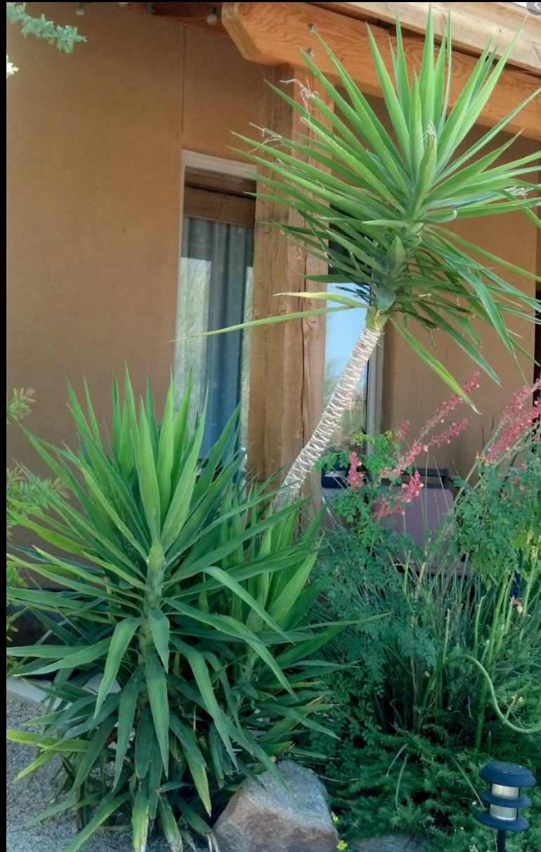
Spanish dagger plant ( Yucca gloriosa )

This plant is not a palm - it may remain in the 0-5 foot zone