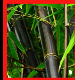
Black bamboo ( Phyllostachys nigra )