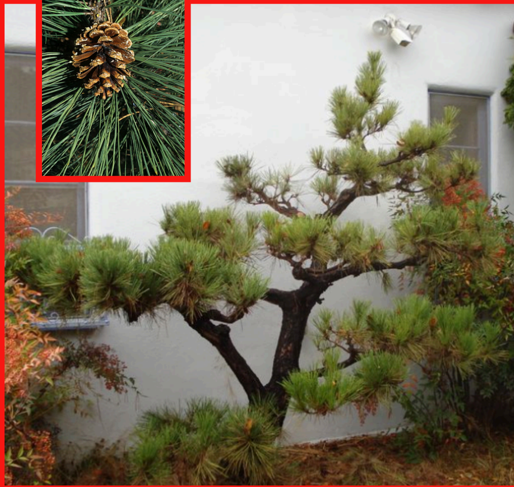
Japanese black pine ( Pinus thunbergii )