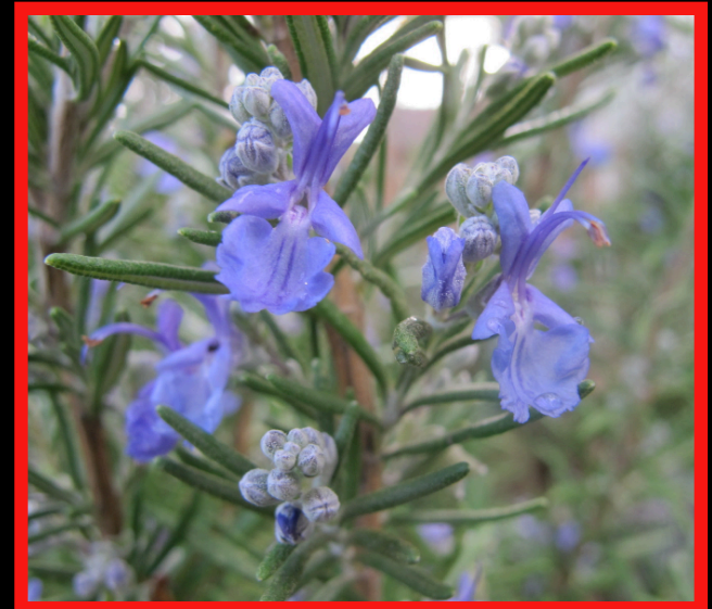
Rosemary ( Rosmarinus officinalis 'Tuscan Blue')