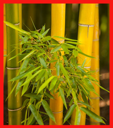
Golden bamboo ( Phyllostachys aurea )