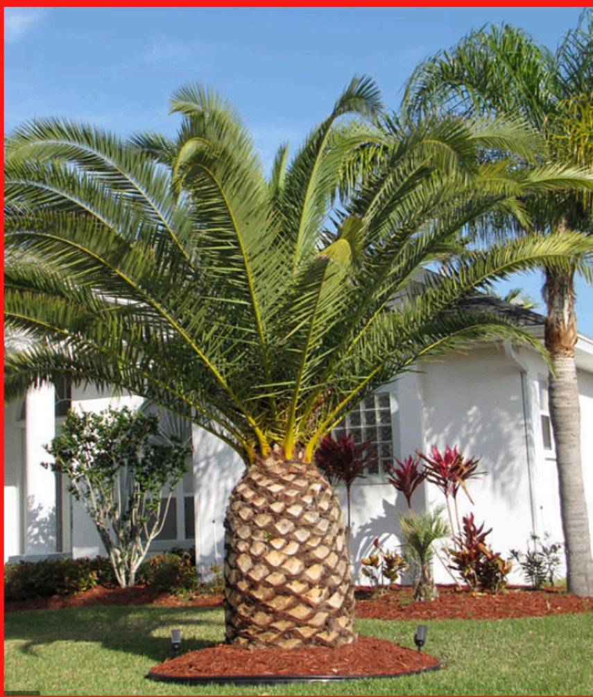
Canary Island date palm ( Phoenix canariensis )

(It is the dry fronds that are a fire danger.)